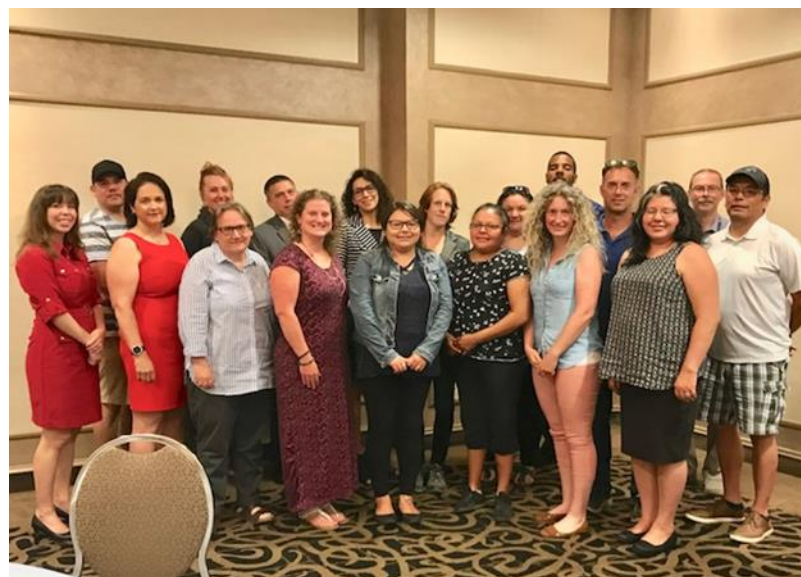
Financial Management for your Business Workshop- Sudbury